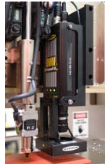
Camera mounted on pickup assembly