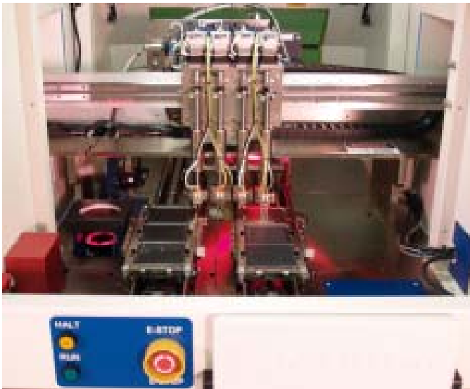
Two inspection sites—before & after laser marking