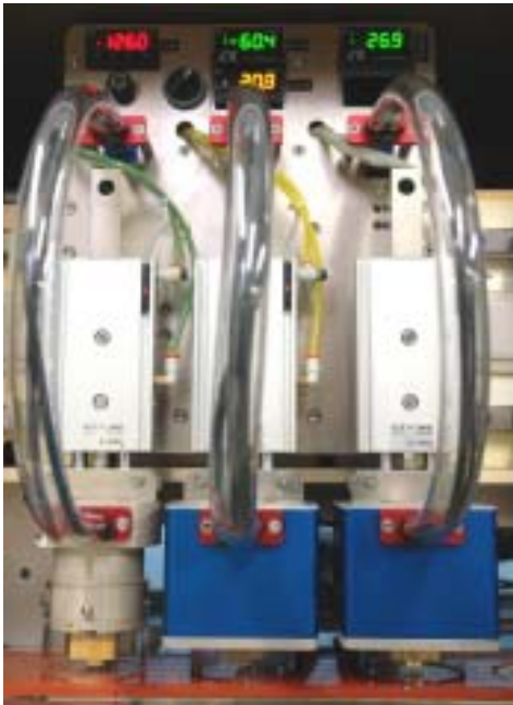
Hot, cold, & ambient thermal test heads