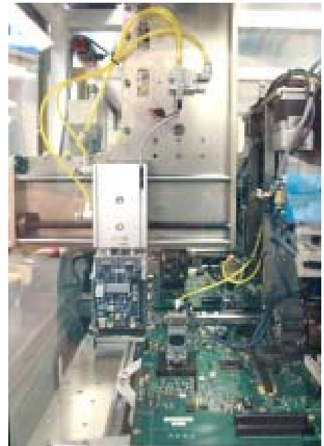
Two-directional test head