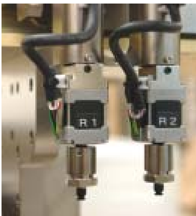
Dual pickup heads with infinite rotation