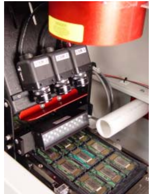
Laser marking chamber with 3 cameras (optional)